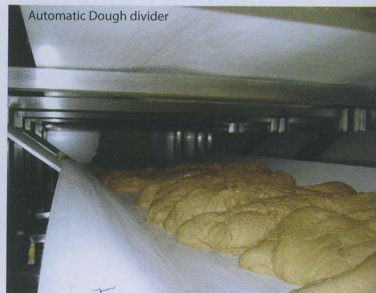
Automatic Dough divider

a range of cutting rollers to cut triangles, rectangles, squares, dough nuts, round and oval shapes with plain or scalloped edges. These units can also be combined with transfer tables and other devices such as Croissant Rollers . The Croissomat range by Rondo are again versatile machines, can provide filled or unfilled croissants from the same machine, have a capacity up to 6000 pieces per hour. Another item to be mentioned is Baguette Module which can handle longmould bread, rolls, baguettes, sandwich rolls and hot-dog buns automatically panned onto baking trays.